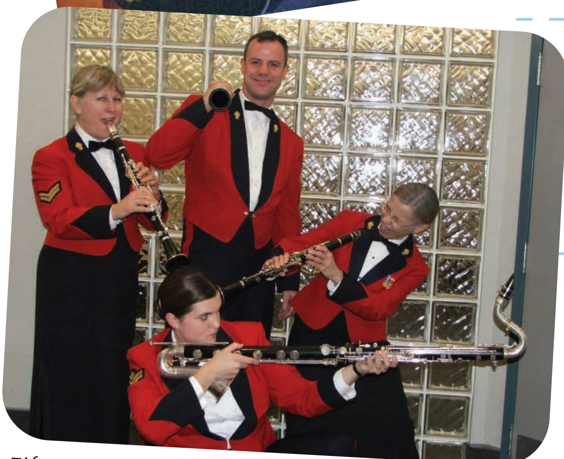
Fifteenth Field Artillery Clarinet Quartet, August 23