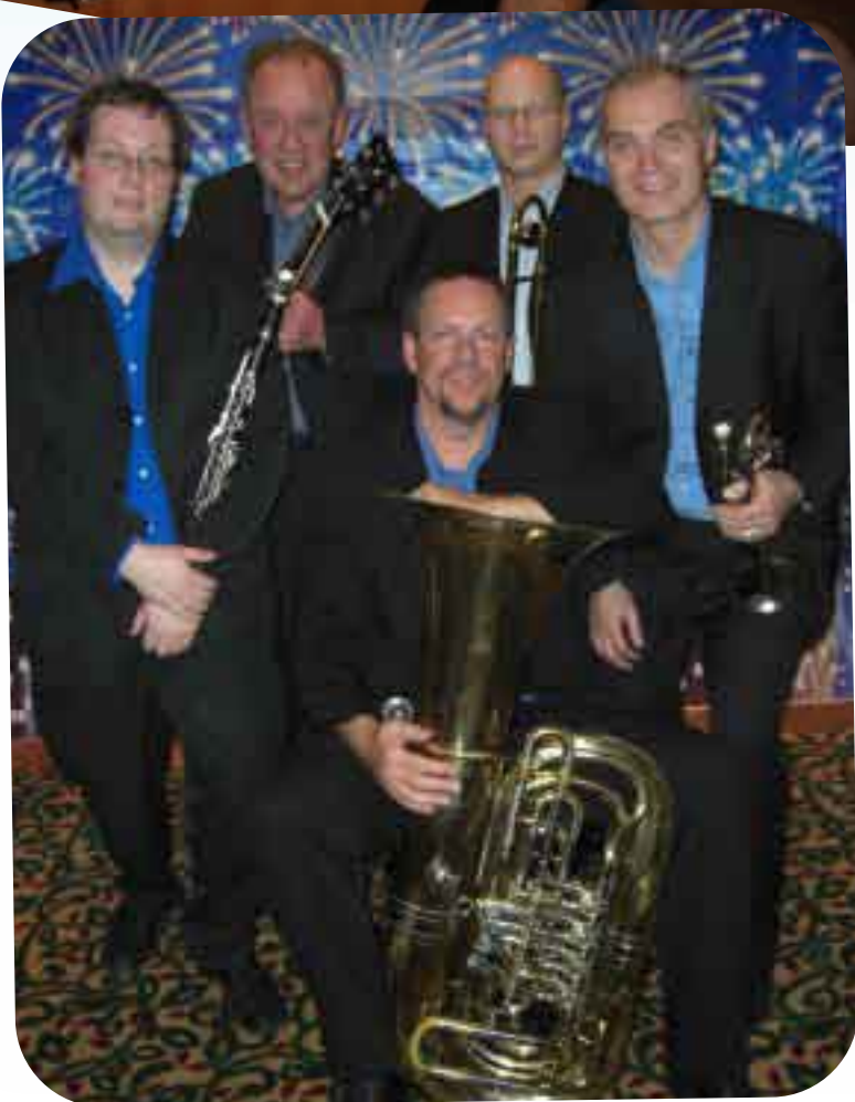
The Creole Jazz Band, August 9

9 Sunday The Creole Jazz Band You'll be whistling Dixie with the upbeat, danceable sounds of The Creole Jazz Band, a five-piece group consisting of a trumpet, clarinet, trombone, tuba and banjo.